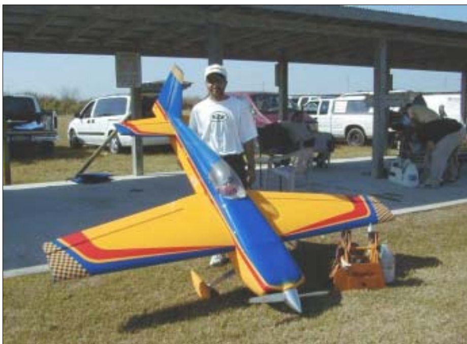
Tony's Edge 540