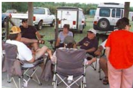
Bull sessions were everywhere and on this day it was great to have the ladies join in. Although, I don't think airplanes was the topic at this one.

I can't wait for next year! From the planning I've been hearing, it's going to be the best yet... don't miss it.