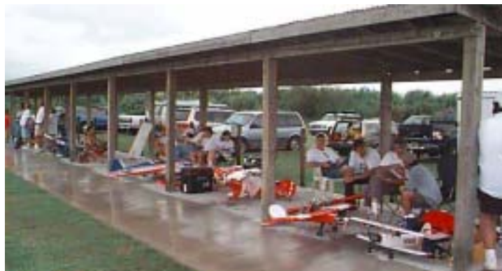
Both pit areas were filled with airplanes and bull sessions. As you can see the pavement is wet from the little rain squall we had, but that didn't dampen anyone's spirits. Later, after the rain quit all those planes were back in the air again.