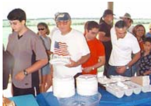
No celebration is complete without food, and these guys were lined up to get theirs. We had BBQ ribs, chicken, beans, corn, etc.