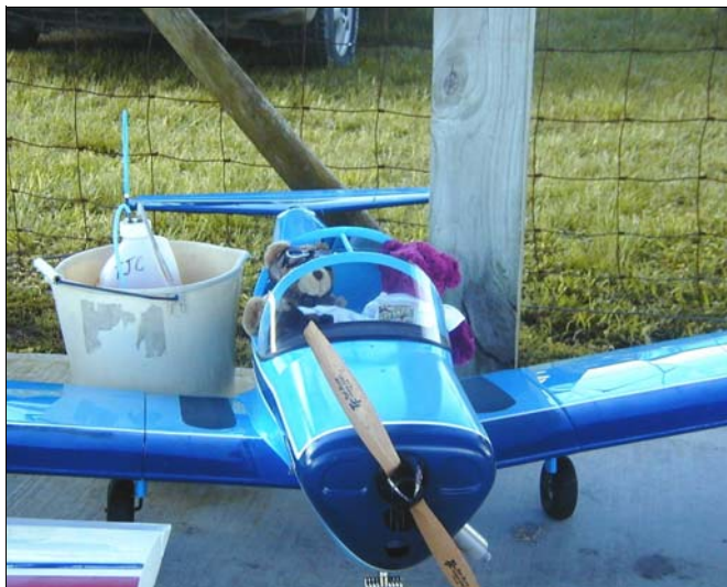
Back in the shady pits, Tom's Ercoupe crew is bear-ly visible